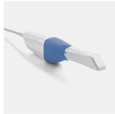
Planmeca Emerald® S