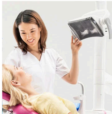
Dental unit accessories