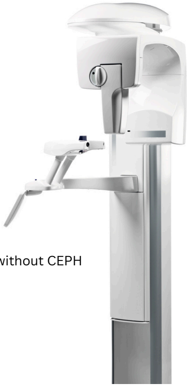
Image without CEPH