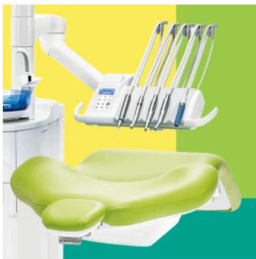
Build your own unit